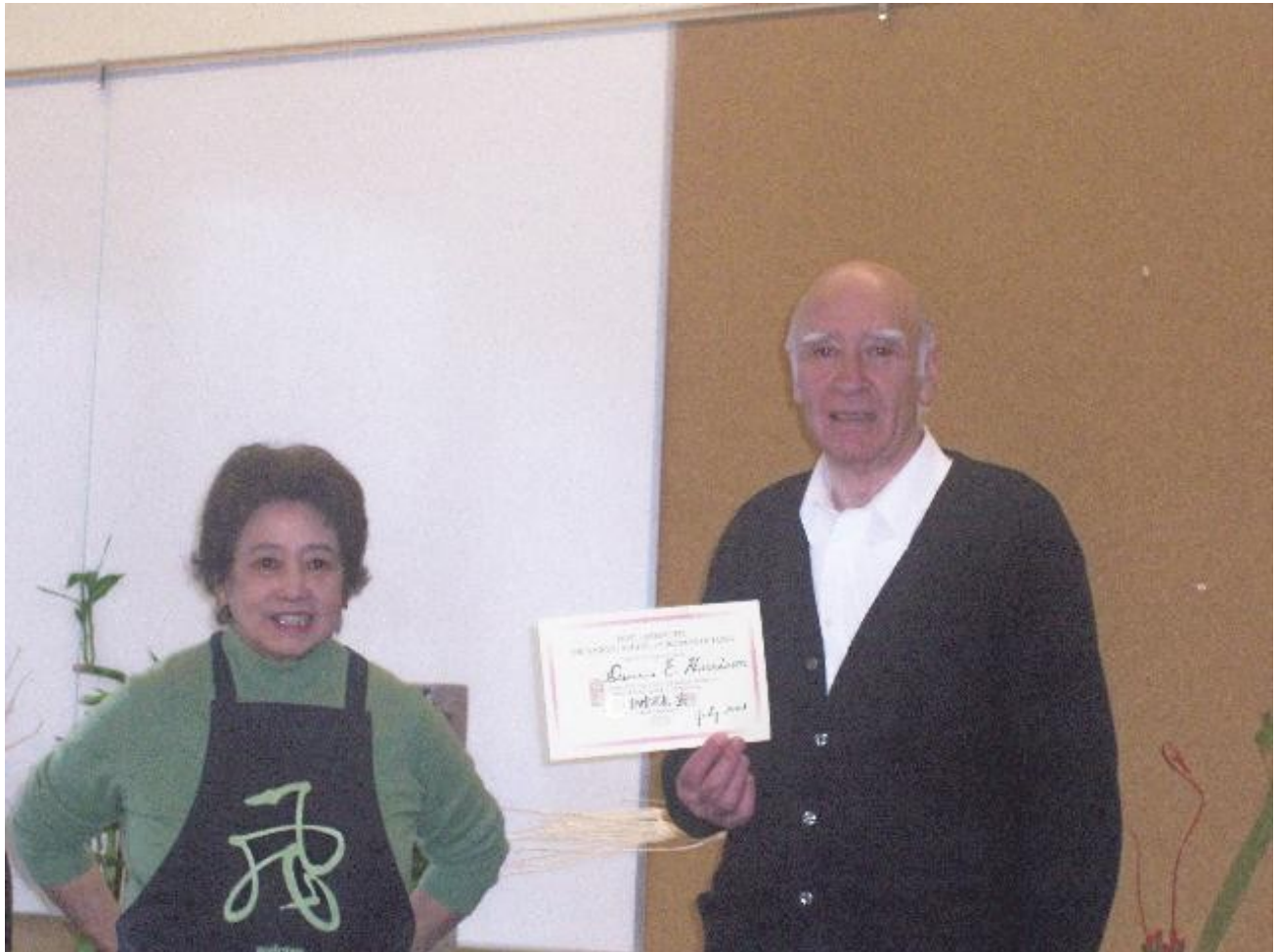
Ikebana Teacher and First Level Award